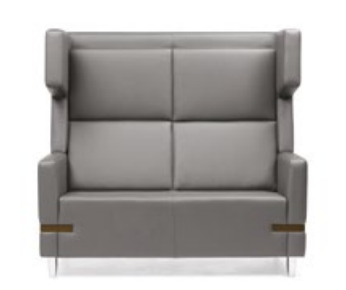
C 602 H Two Seat