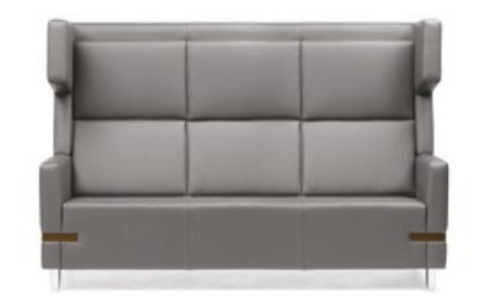
C 603 H Three Seat